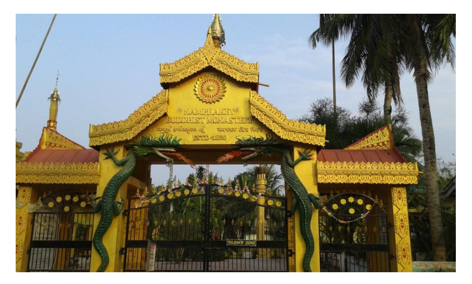
Fig.2.3. Buddhist monastery at Namphake

The Tai-Phake community follows Buddhism. They have a Buddhist monastery in their village known as Baapsung" in their language. All the people of the village strictly follow all regulations of their religion. The Buddhist monastery at Namphake village was established in 1850. The monastery has mosaic and tiled floors. The head priest of the Namphake Buddhist temple is known as "Vante". The affairs of the monastery are run by the monks with active cooperation of the people. The people provide food and clothes to the monks.