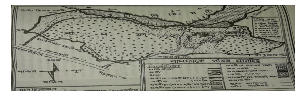
Fig.1.1. Map of Namphake village