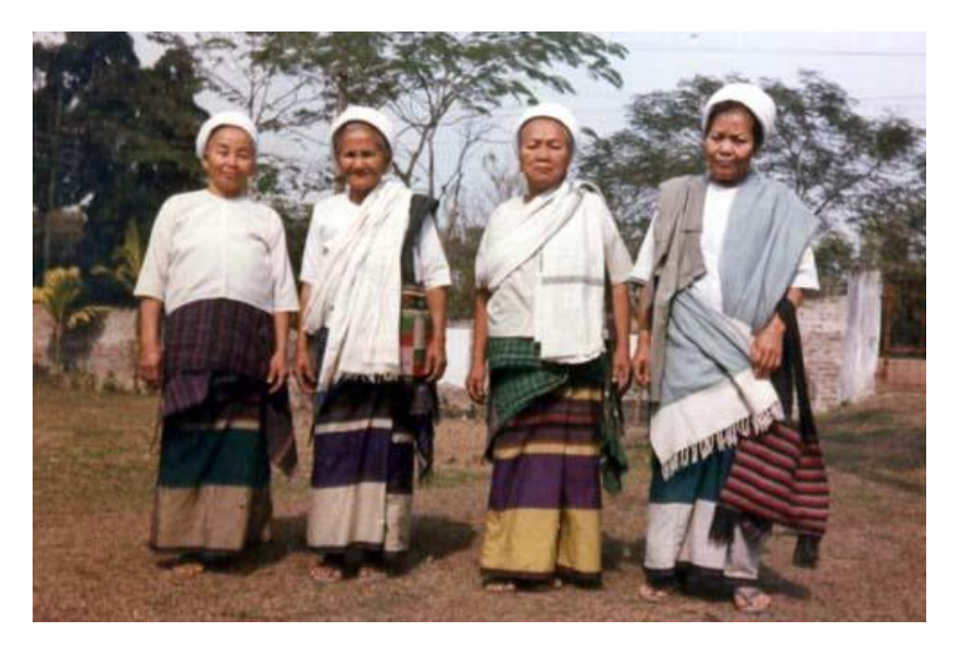
Fig. 2.2. Dress